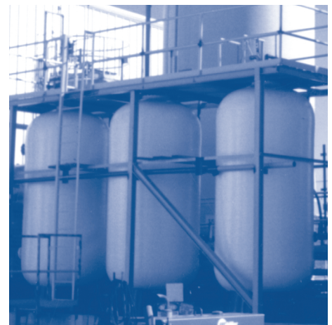
Operating FerriMet™ System

The solids were nonhazardous as the TCLP test results were 2 orders of magnitude below the limit for arsenic. Operating costs were extremely low, with chemicals costs less than $0.030 per 1000 gallons, and process generated solids waste disposal costs less than $0.004 per 1000 gallons.